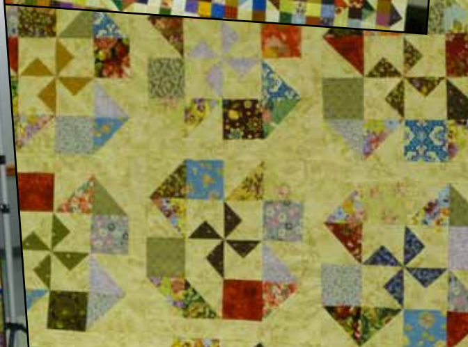
The border of the Courthouse Steps quilt (at the left) used all Cindy's orphan blocks.