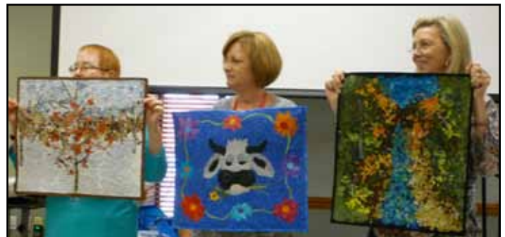
Members' confetti quilts from workshop