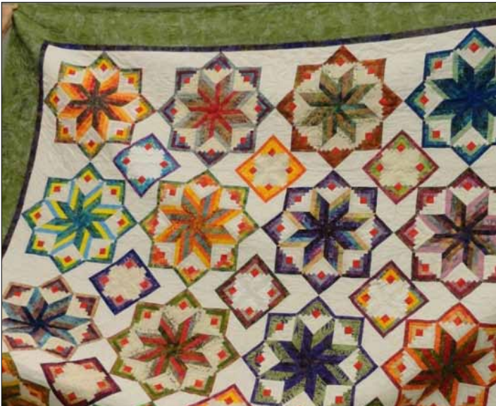
Brantley's Hope raffle quilt by Happy Quilters of Petal