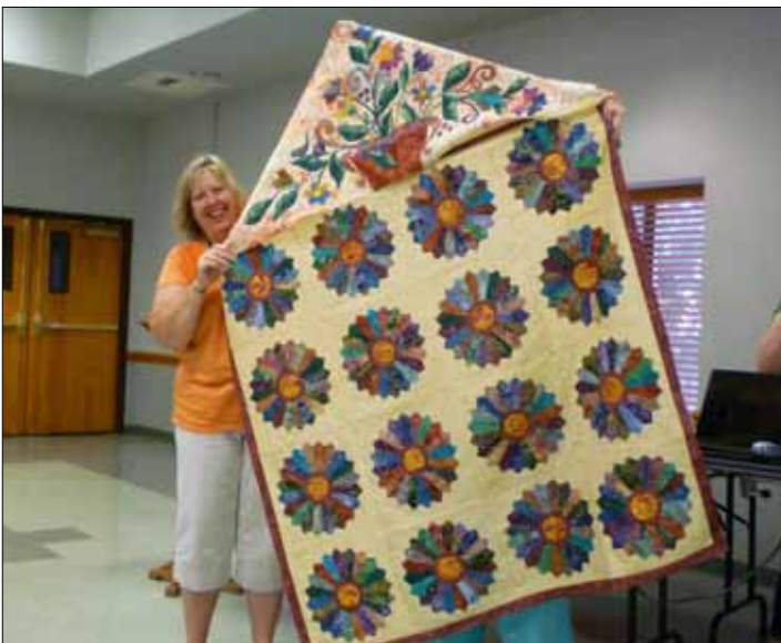
PBQ raffle quilt in progress